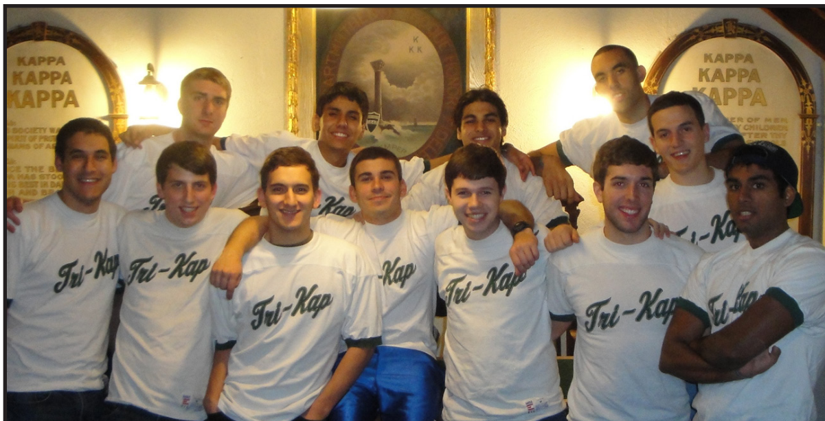
The 2012-2013 Tri-Kap Executive Board