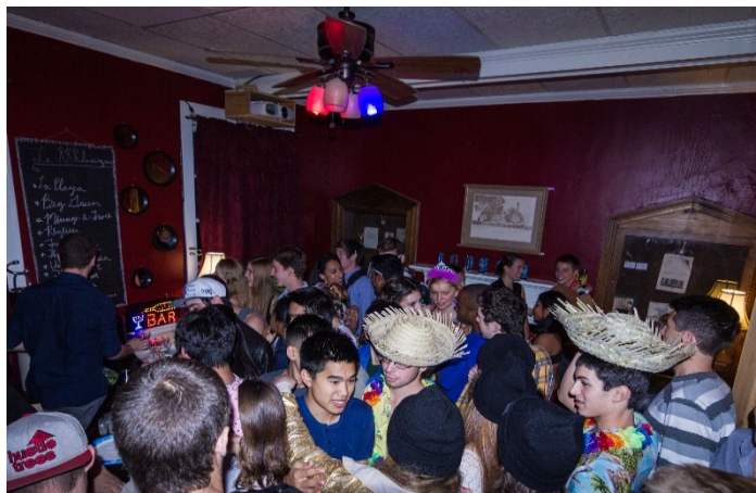
The Dartmouth Community enjoying itself at our first bar-style event