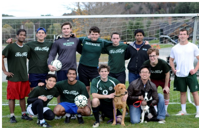
The victorious Tri-Kap Intramural Champions