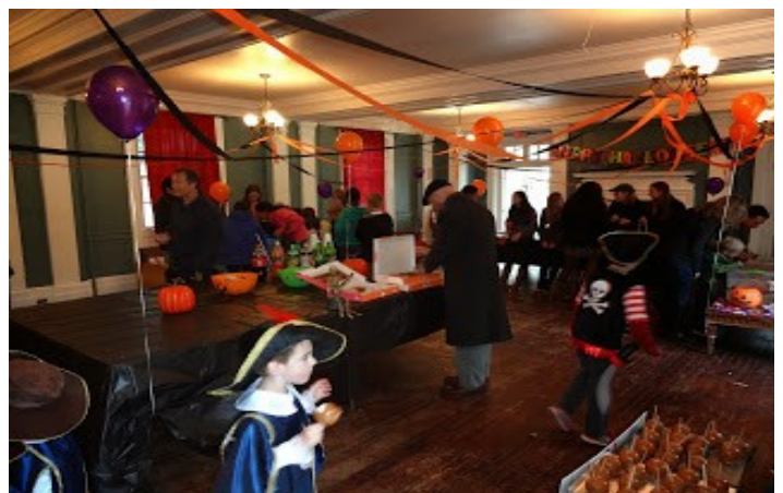
Families of the Upper Valley community enjoying the many activities at our annual Haunted House