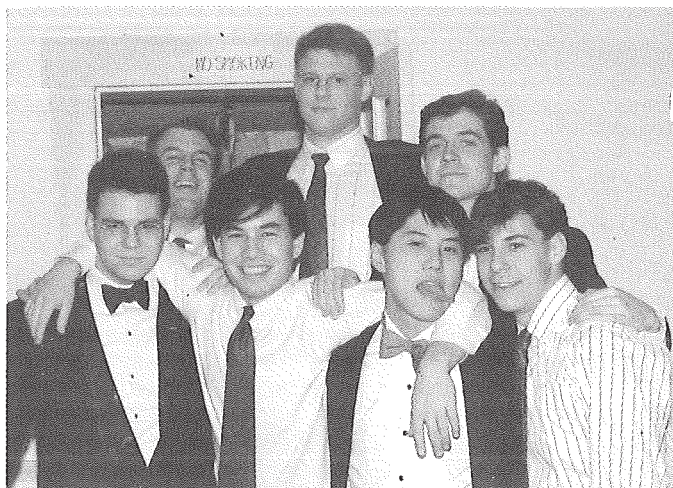
Some members of the class of '91 ham it up at a recent formal.