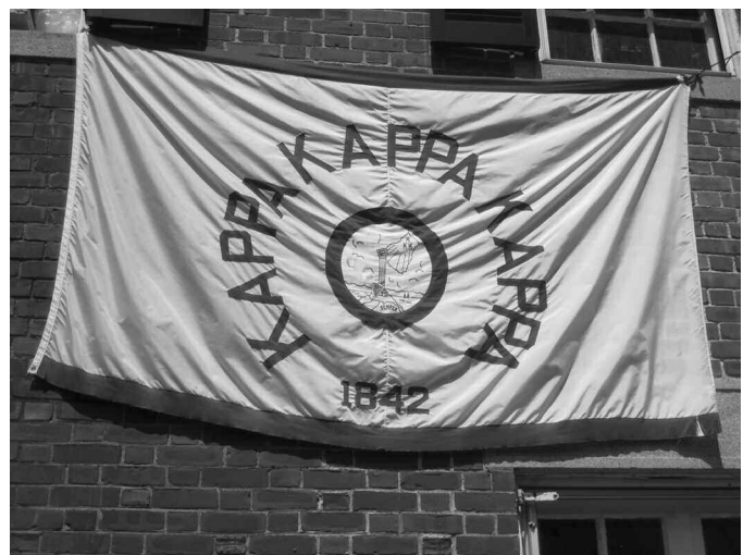
The Old Tri-Kap Seal Hanging Proudly Out Front