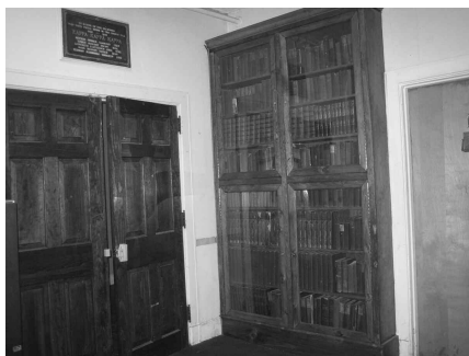
Our Brand-New Library Bookcases

The Trikap Board of Directors is conducting a survey to collect valuable information on the Trikap Alumni. Your response would be greatly appreciated. This survey should not take more than five minutes of your time.