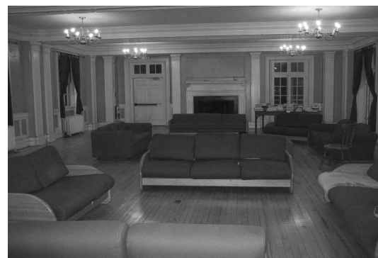
The Living Room- when we aren't partying