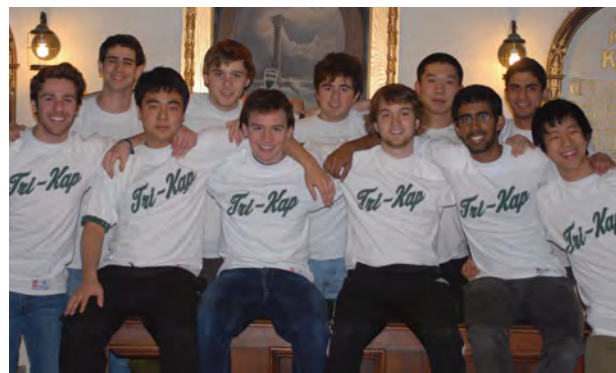
The new regime.