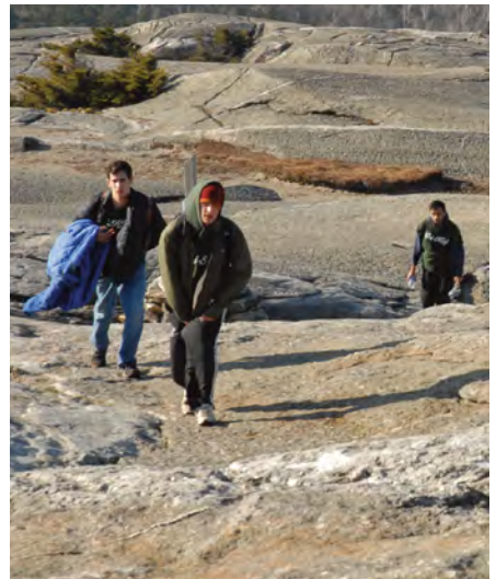
The Class of 2012 and a handful of older brothers woke up for a 5 A.M. breakfast at Fort Lou's and a hike up the 3,121 ft. Cardigan Mountain this fall.