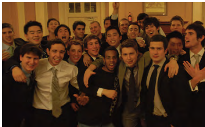
The Class of 2010 at Fall Formal